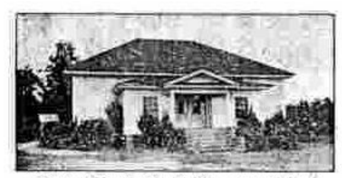
Original Brushy Creek Elementary School 1916

Brushy Creek Elementary School has a long history of excellence in education, care and concern for students, and a strong involvement with the community. The first Brushy Creek School building was built in 1916. It was a four-room structure and stood across Brushy Creek Road from the present day building. Early on, quiet fields and busy farms surrounded the school. Across the street was Brushy Creek Baptist Church; distinguished for being the oldest church in Greenville County. Up the road was the prosperous and progressive Silverleaf Dairy.